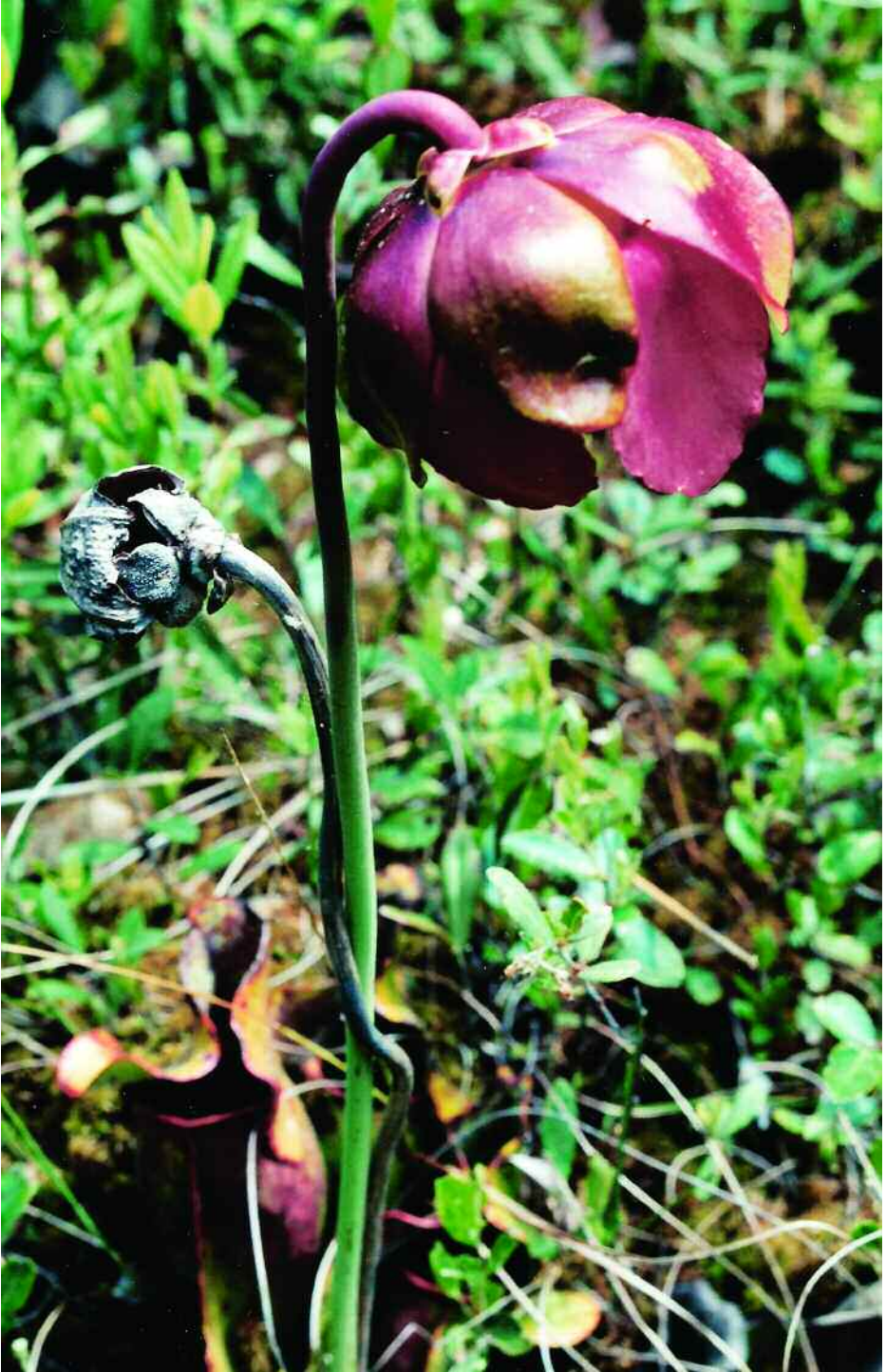
Figure 1: Sarracenia purpurea flowering in New Hampshire.